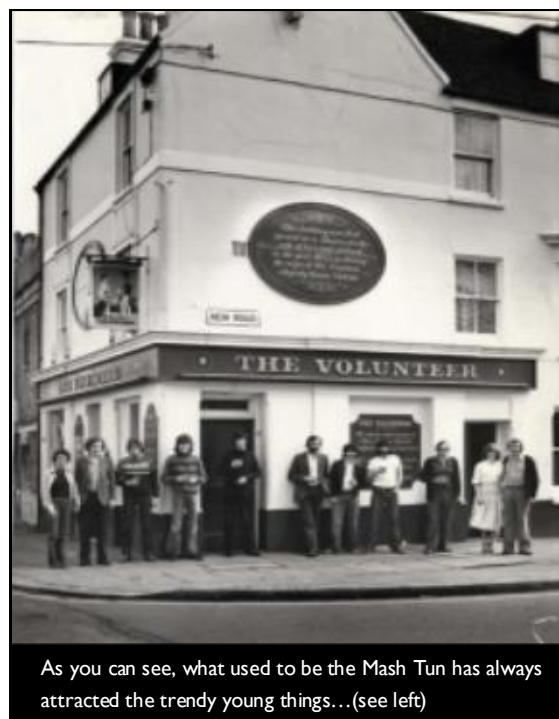
As you can see, what used to be the Mash Tun has always attracted the trendy young things... (see left)

Members of the Coptic community, and the Muslim and Progressive Jewish faiths are beginning a programme of video and oral history training with QueenSpark practitioners. They will interview members of their community and produce video diaries, in advance of web-skills training at the CSV Media Clubhouse, to enable them to tell the story of their faith's relationship with the history of Brighton and Hove. In addition to the internet presence on QueenSpark's website, a book will be published and launched at the end of 2005.